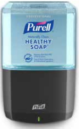
PURELL ES8 ENERGY-ON-REFILL AND SMARTLINK™ CAPABILITY

Touch-free systems built for reliable performance and maintenance ease.