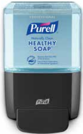
PURELL ES4 PUSH-STYLE

Durable and reliable push-style systems. Easy to maintain.