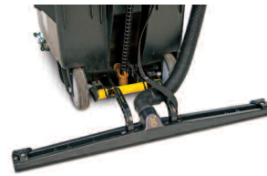
Vac Only Vacuum removal of liquids, cleaning solution, stripper.