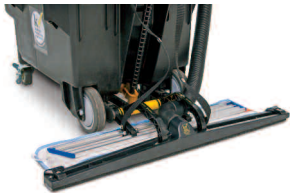
Spread-and-Vac Simultaneously dispense and spread cleaning solution with instant vacuum extraction.