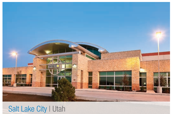
Salt Lake City | Utah