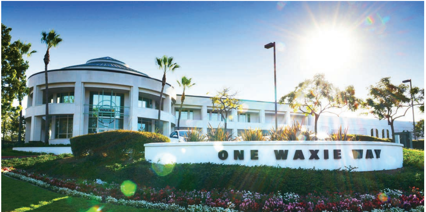
Corporate Headquarters | San Diego, California