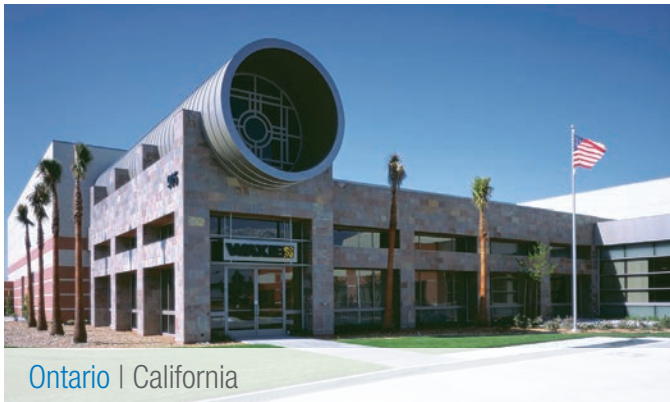
Ontario | California