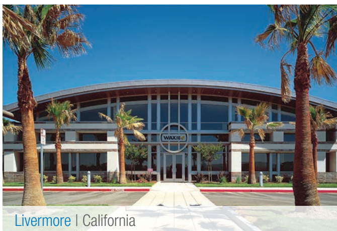
Livermore | California

3808 N. Sullivan Road, Building 25C Spokane Valley, WA 99216-1608 Phone: (509) 344-3900 Fax: (509) 344-3899