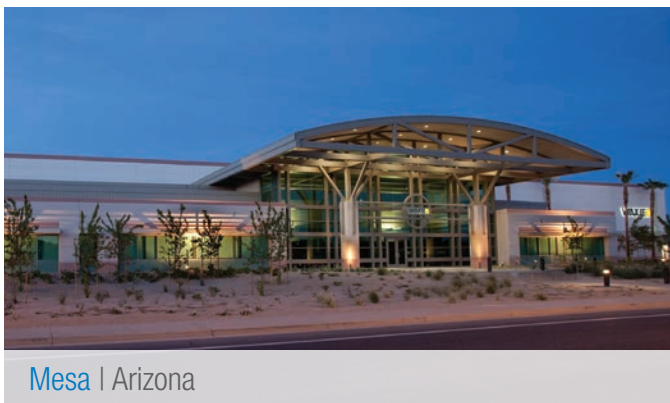
Mesa | Arizona