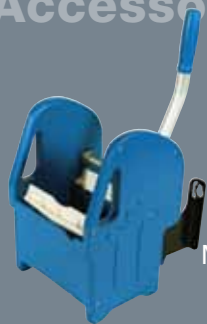
Mop Wringer & Bracket