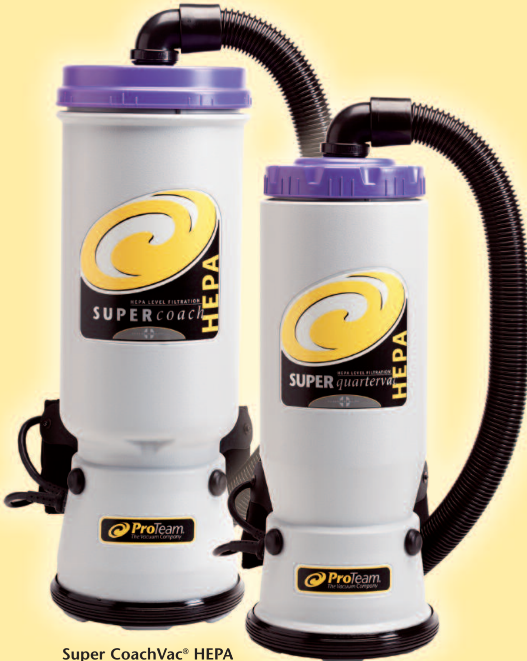
Super CoachVac ® HEPA Item #573111