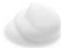
Foam soap from one push