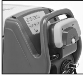
Ergonomic and safe paddle system for operator comfort