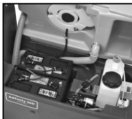
Access to batteries and AXP onboard dispensing system