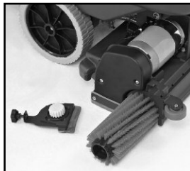
Tools-free removable brushes on all model scrub decks