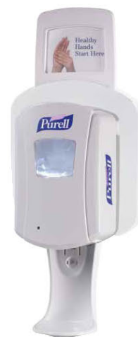
PURELL® ADX-7™ shown with white MESSENGER™ Dispenser Station, TRUE FIT™ Wall Plate, and SHIELD™ Floor & Wall Protector