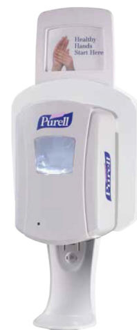
PURELL® ADX-7™ shown with white MESSENGER™ Dispenser Station, TRUE FIT™ Wall Plate, and SHIELD™ Floor & Wall Protector