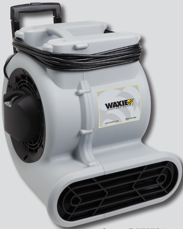
Item # 571784