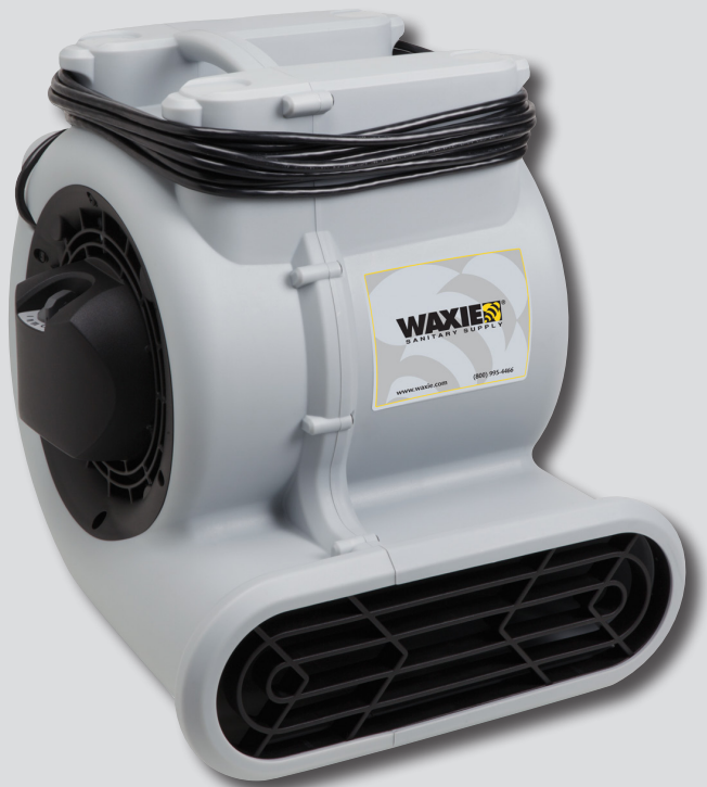
Item # 571782

Maximum airflow and low amp draw combine to make this air mover the first choice for Carpet Cleaners and Restoration Contractors alike. With 3 fan speeds and 3 operating positions, this air mover tackles every air circulation requirement with ease and the ultimate quiet performance.