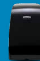
MOD* Electronic Touchless Skin Care Cassette Color: Black