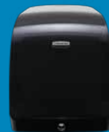
MOD* HRT Dispenser Color: Black