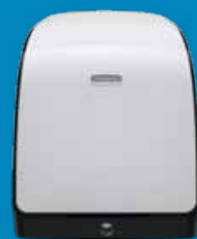
MOD* HRT Dispenser Color: White