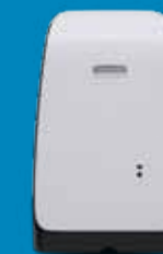
MOD* Electronic Touchless Skin Care Cassette Color: White