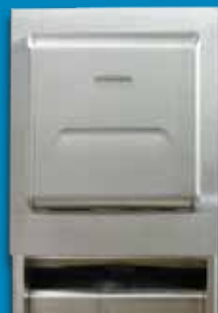
MOD* HRT Dispenser Color: Stainless