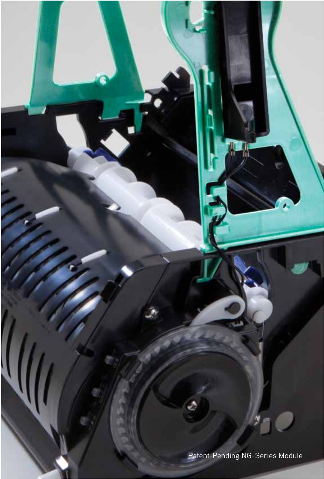
Patent-Pending NG-Series Module

M-Series: Controlled manual delivery offers the hygiene of touchless dispensing without the batteries.