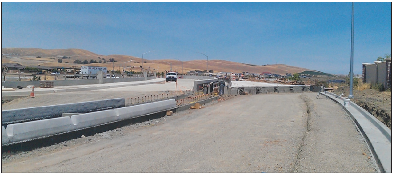
Eastbound Stoneridge Drive between Trevor Parkway and the bridge.

A five-acre neighborhood park adjacent to the Stoneridge Drive extension will provide residents with two new tennis courts, a grass field and a walking path. Nearby, progress continues on Stoneridge Creek, which encom-