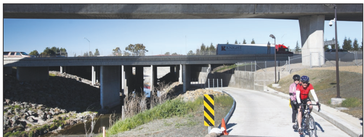
Another spectacular spring in Pleasanton!