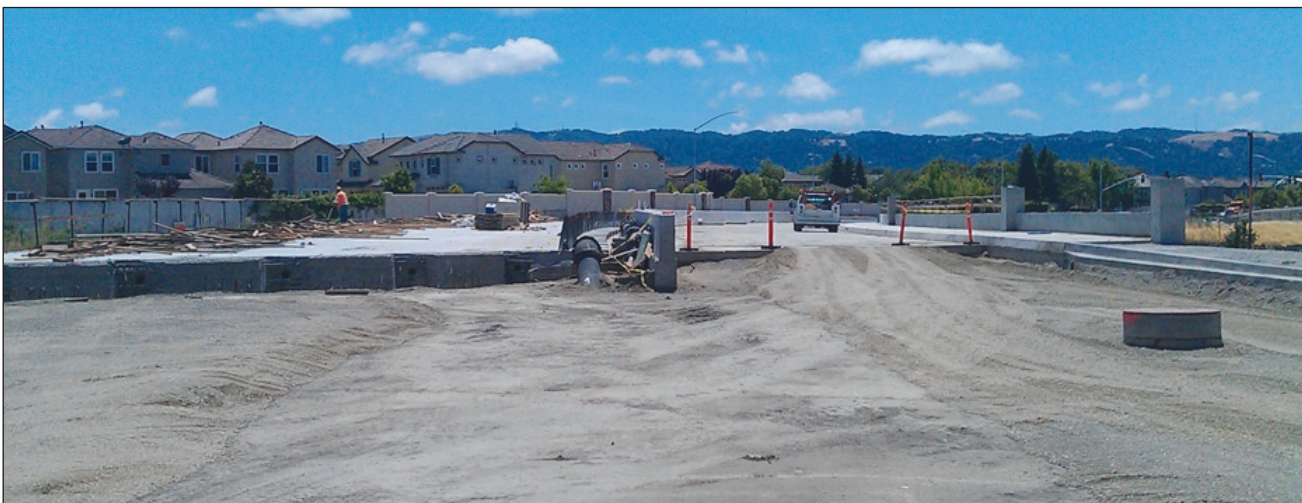
Westbound Stoneridge Drive, just east of the new bridge.

passes 46 acres of the Staples Ranch property. The continuing care retirement community is scheduled to open in September and will feature several hundred residences, restaurants, a library, game room, business center, spa and fitness center, performing arts theater, and many other amenities. An on-site health center will also be located on the property and will feature options for assisted living, memory support, and skilled nursing needs.