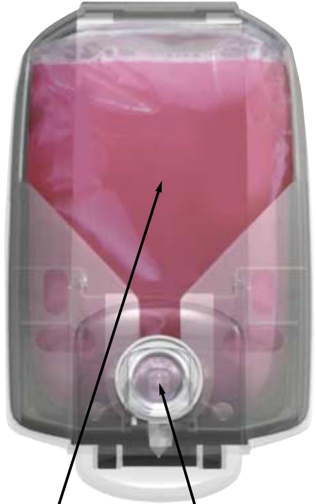
The Grand Touch ® Dispenser

There's no box to waste valuable space. Bag makes full use of interior space.